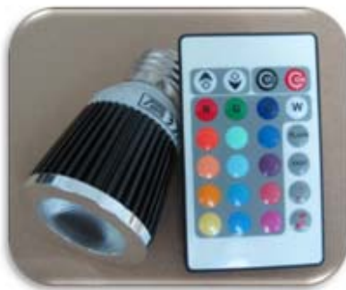
5W RGB LED SPOTLIGHT