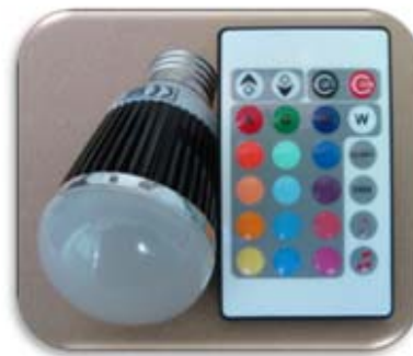
5W RGB LED BULB